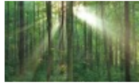
DELAWARE NATION ENTERS NEW ERA IN WASTE MANAGEMENT