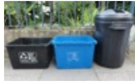
RECYCLING COMES TO MORAVIANTOWN!