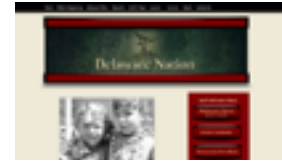
FOR THE LATEST NEWS GO TO www.delawarenation.on.ca