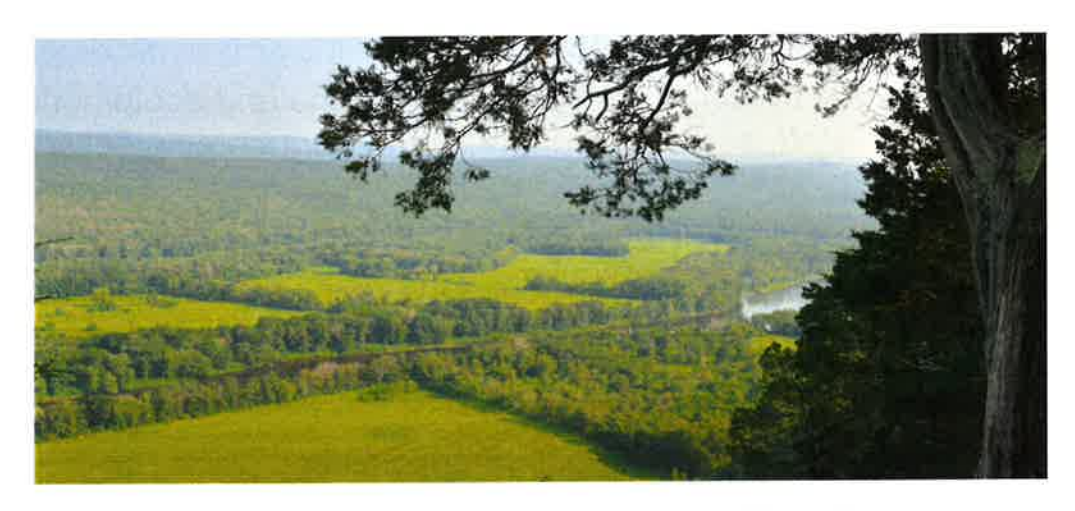
The view above of Minisink Island, Delaware Water Gap

After we returned, we did a presentation to the community on August 8, 2023, at the community centre on our trip and asked those in attendance if they were interested in planning a community trip in the future to the Delaware Water Gap. It was decided to take two community trips; one in the summer and the other in the fall of 2024. Gaming Revenue allocation of $50,000.00 was to assist in the planning of the community trips.