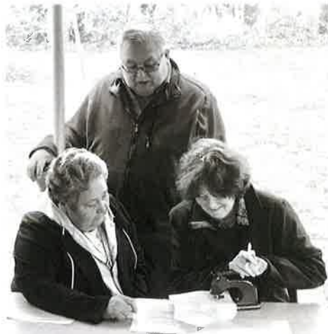
Signing over of Fairfield Museum, May 10th, 2019.

Fairfield museum has been owned and operated by the United Church of Canada for 74 years, from its opening in 1945 until its return to the Delaware Nation on May 10th, 2019. Fairfield Museum has always told the history of the Lenape, but the Lenape had no say in how that history was told... Until now.